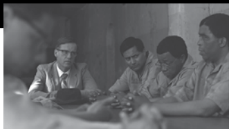
An Act of Defiance