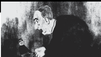
The State Against Mandela and the Others