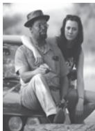
Farewell Ella Bella